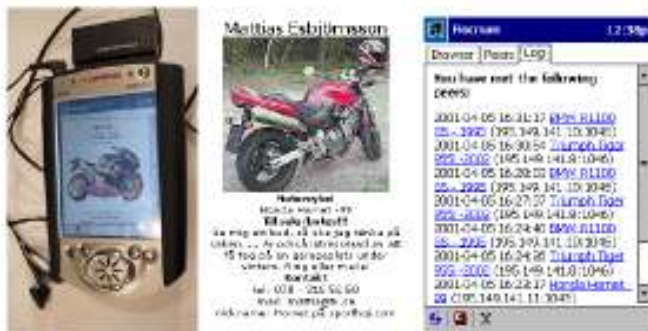
Fig. 1. The hardware used (left). A typical biker's page (middle). Screenshot of the log (right).